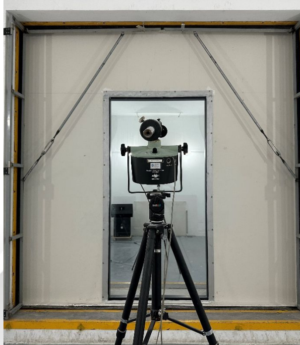
Figure 2 : “S108 Offset Single Glazed” partition with 12mm thick tempered glass facing the source room