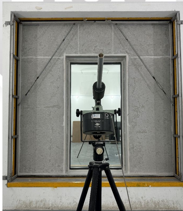
Figure 3 : “S108 Offset Single Glazed” partition with 12mm thick tempered glass facing the the receiving room